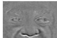
Figure 3: Difference images from the BBC data set. Row 1: Genuine, Rows 2 and 3: Support Vectors, Row 4: Posed