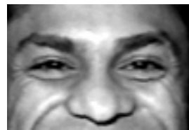
Figure 2: Examples from the BBC data set. Row 1: Genuine, Row 2: Posed.